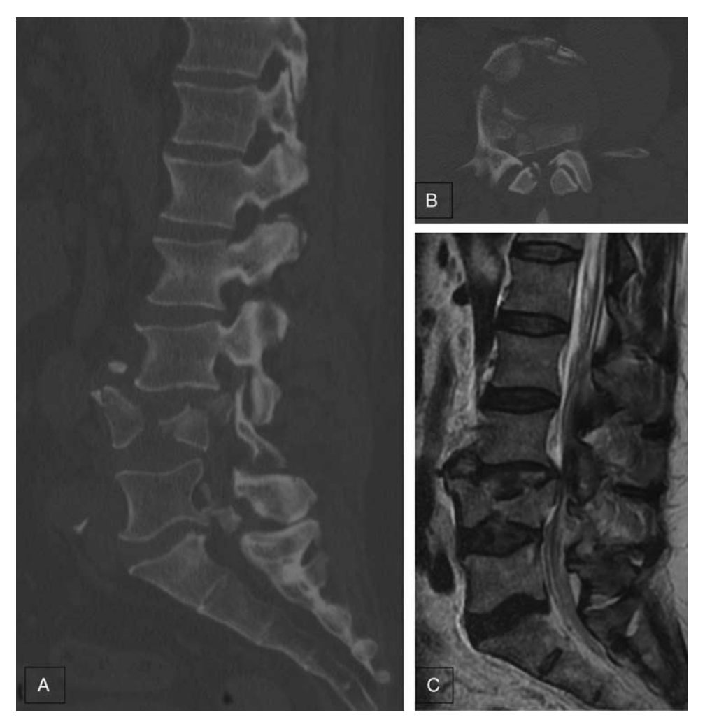
FIGURE 1. A, Sagittal computed tomography of L4 burst fracture showing damage to all 3 columns. B, Axial view. C, Sagittal T2-weighted magnetic resonance imaging showing retropulsion of fracture fragments into the spinal canal.

following surgery. There were no reports of neurological worsening following surgery.