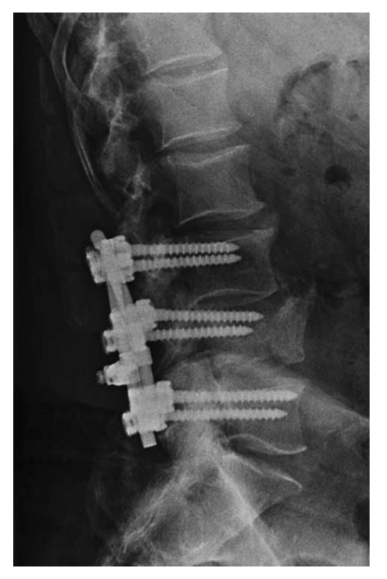
FIGURE 3. Follow-up radiograph demonstrating short-segment pedicle fixation of L4 fracture.